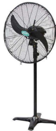
E37 Industrial Fan