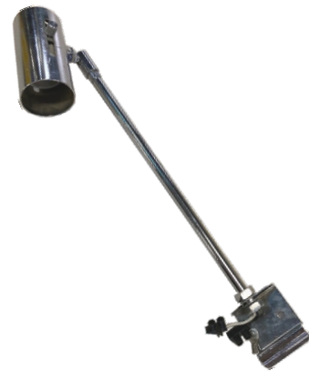
E04 Chinese Long Arm Spot