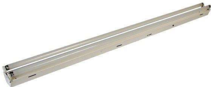
E21 Double Tube Fluorescent 600mm