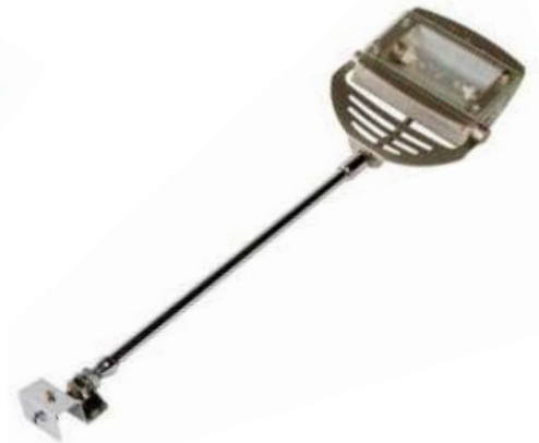
E03 150 Watt Flood Light on Arm