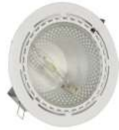
E59 150 Watt Round Metal Halide (Recessed)