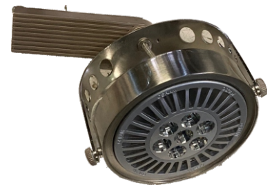
E51 12 Watt German Track