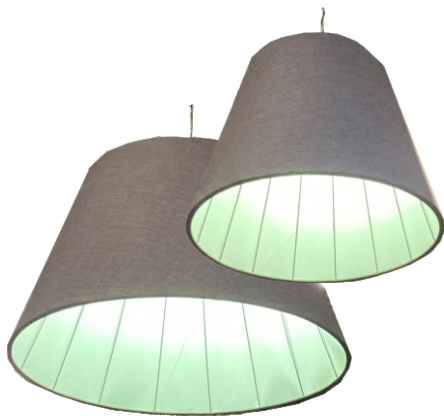
E31 Cone Pendant Light