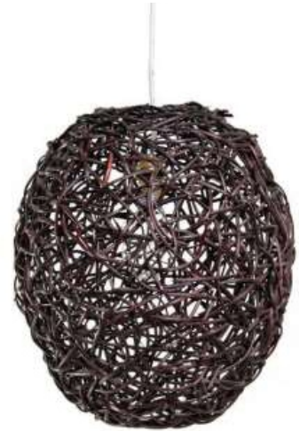
E54 Bird Nest Pendant Light