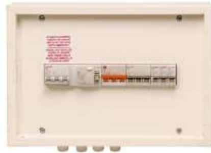
E43 60 Amp Three Phase DB