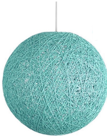
E62 Turquoise Pendant Ball Light