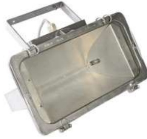
E15 1500 Watt Flood Light