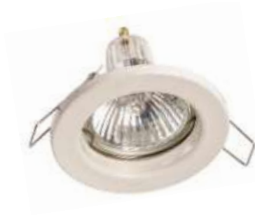
E11 50 Watt Downlighter