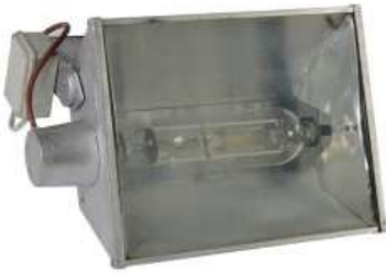
E17 2000 Watt Flood Light