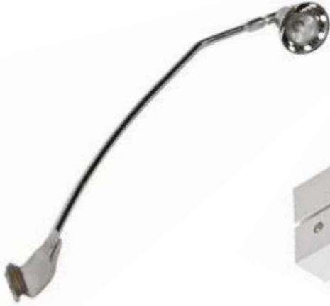
E01 50 Watt Spot on Arm