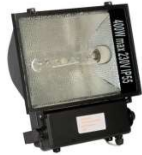
E16 400 Watt Flood Light