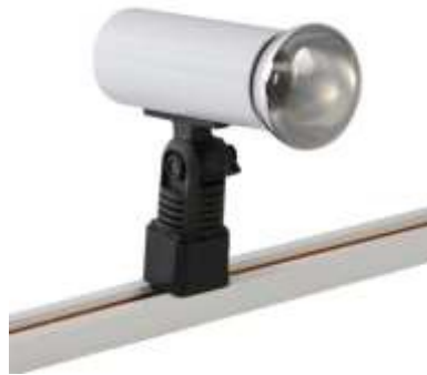
E08 100 Watt Spot Open