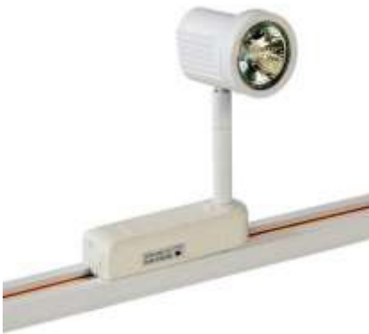
E07 50 Watt Track Spot