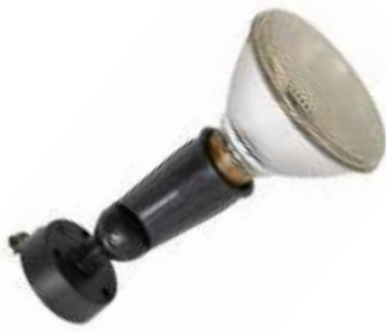
E10 150 Watt Spot