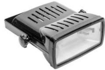
E20 150 Watt Metal Halide Flood Light