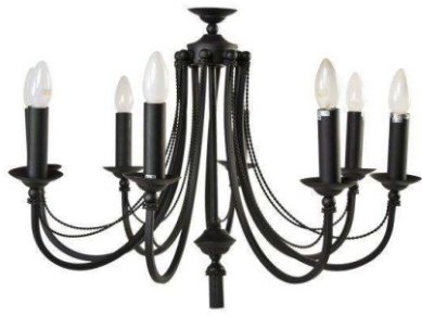
E33 Wrought Iron Chandelier