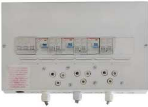
E42 30 Amp Three Phase DB