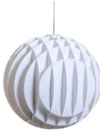
E55 Golfball Pendant Light