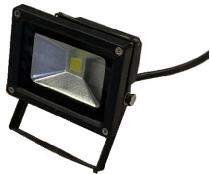
E26 70-Watt LED Flood Light