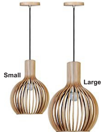
E27 Lattice Wood Pendants