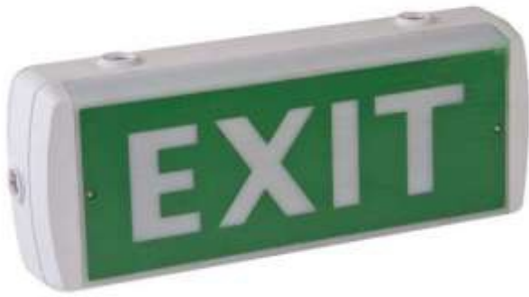
E35 Exit Light