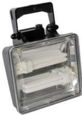
E18 72 Watt Energy Saver Flood Light