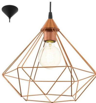
E28 Rose Gold Wire Pendant