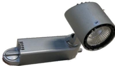
E06 12 Watt LED Track Spot - Silver