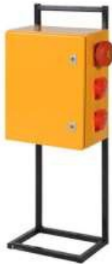
E44 125 Amp Three Phase DB