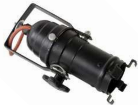
E27 50 Watt Black Birdie Parcan