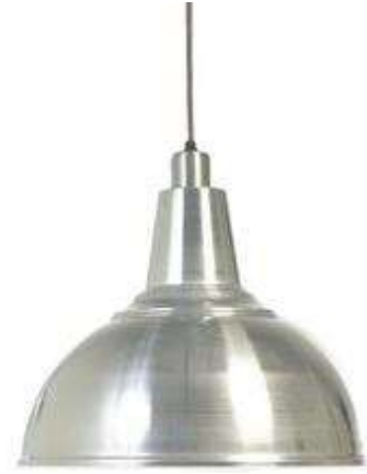
E32 Pendant Light