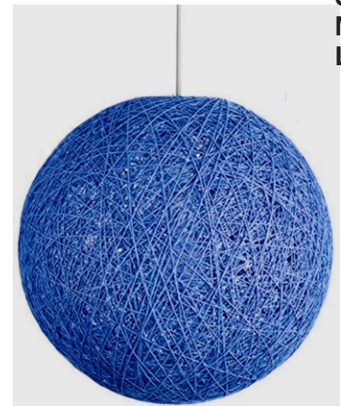
E63 Royal Blue Pendant Ball Light