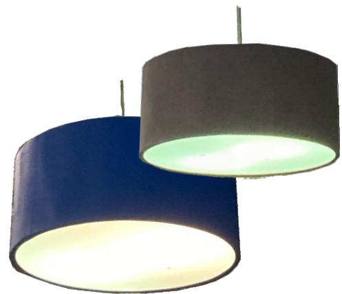
E30 NGC Lamp Shade Pendant Light