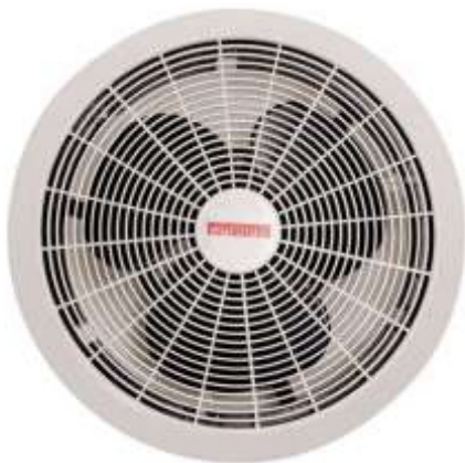
E38 Recessed Extractor Fan