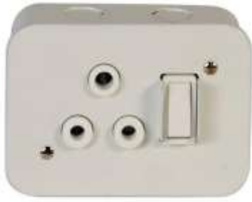
E13 15 Amp Plug Point