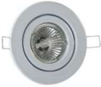
E12 50 Watt Tilt Downlighter