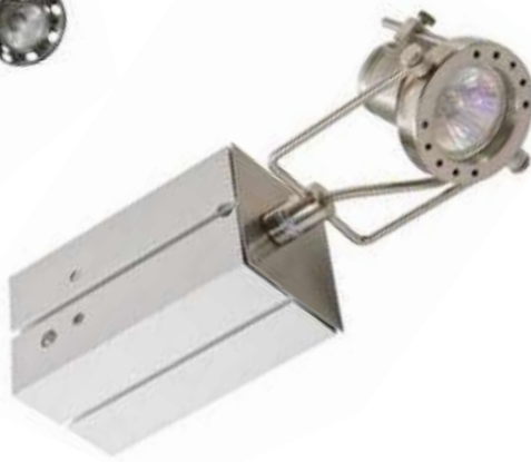
E02 50 Watt Spot on Arm Maxima