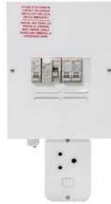
E41 Single Phase DB