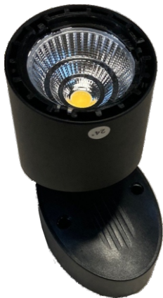
E05 7 Watt LED Track Spot - Black