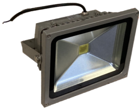
E 25 30-Watt LED Flood Light