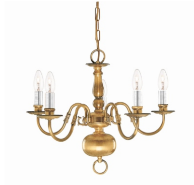
E46 Bronze Chandelier