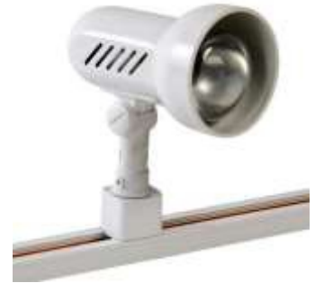
E09 100 Watt Track Spot Turbo