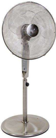
E36 Standing Fan