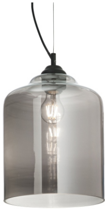
E58 Smoked Glass Pendant