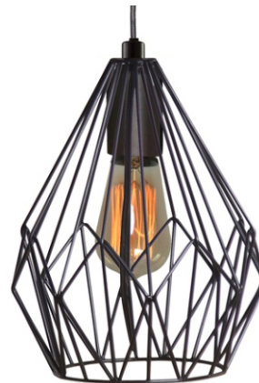
E28 Black Wire Pendant