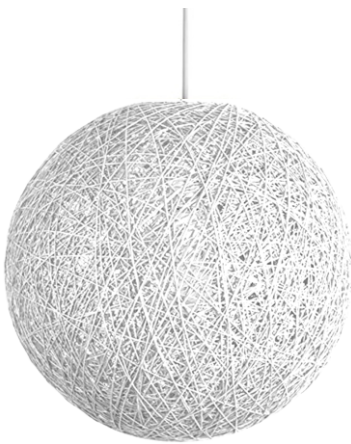
E61 White Pendant Ball Light