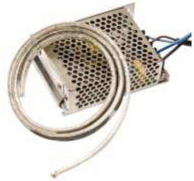
E57 LED Strip Lights - RGB