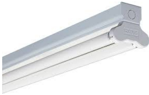
E47 1.2 LED FLUORESCENT DBLE TUBE