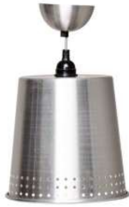
E56 Perforated Pendant Light