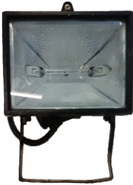
E14 500 Watt Flood Light