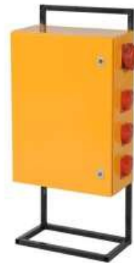
E48 250 Amp Three Phase DB