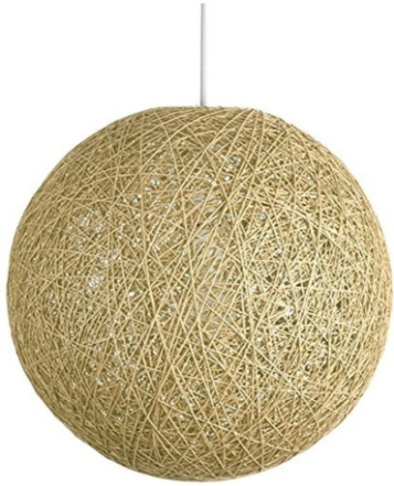
E60 Large Tan Ball Light